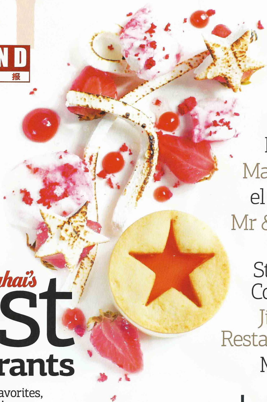
Table No. 1