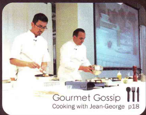
Gourmet Gossip Cooking with Jean-George p18