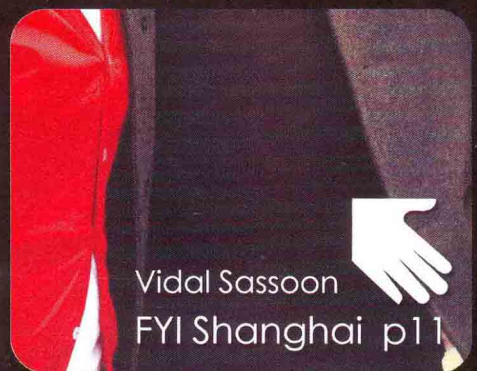
Vidal Sassoon FYI Shanghai p11