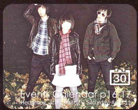
Events Calendar p16-17 Hedgehog at Wuliang • Saturday April 11