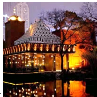
Barbarossa: chic