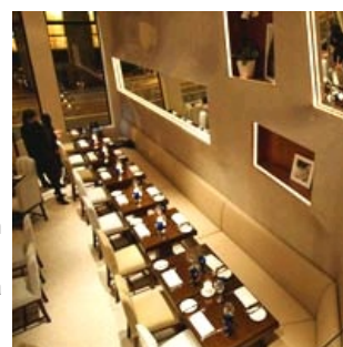
Hamilton House

Tucked away by the riverside behind the Oriental Pearl Tower is Salvatore Cuomo's original Pudong location, The Kitchen (tel: 5054-1265, Unit D, 2967 Lujiazui Xi Lu), another Shanghai dining favourite. The airy Italian is a great place for sundowner drinks looking across the water to Puxi, and its woodfired oven turns out arguably the city's best pizza.